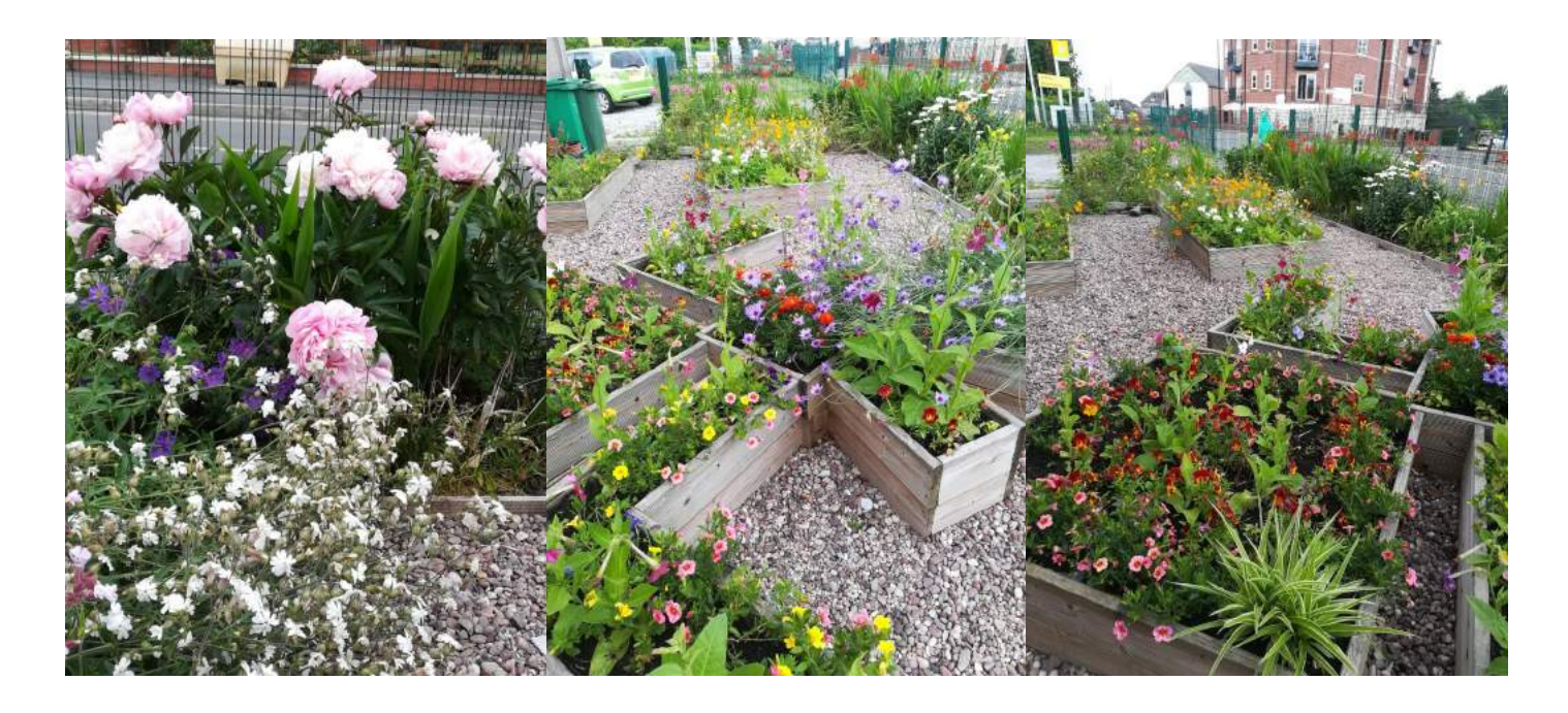
Parrs Wood Road

Although we still cannot have scout meetings we have been able to continue with zoom meetings and all sections have gained a number of badges during lockdown. I'm pleased to say that the children in the section I run, Beaver Scouts, have gained a number of gardener badges so maybe we'll see some of them helping out in the future. Helen