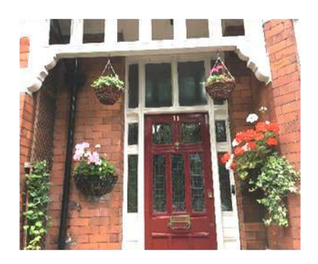
Best wishes to all 'Didsbury in Bloomers' Sue