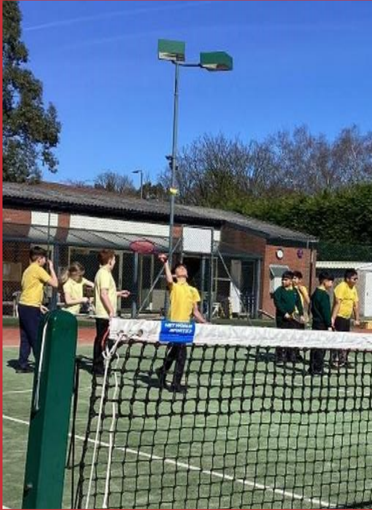
Every week, UKS2 has been attending tennis sessions at the local tennis club.