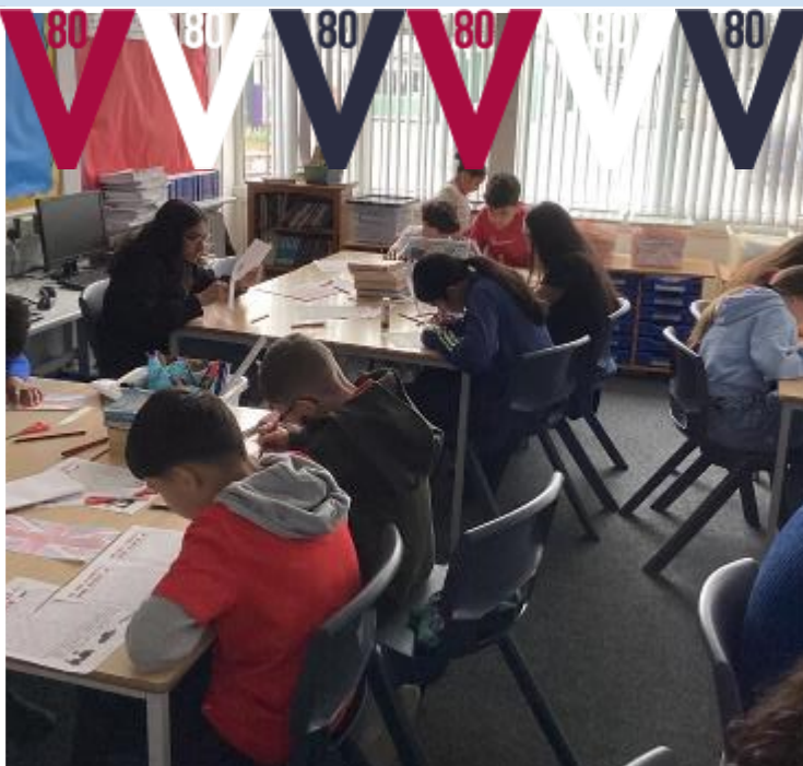
Spruce Class celebrated the 80th anniversary of VE Day with word searches, handmade Union Jack flags, and wearing red, white, and blue.