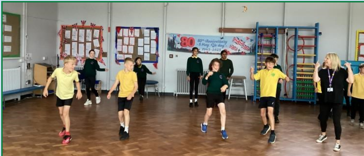
UKS2 pupils performed a line dance to 'House of Bamboo' with great energy and teamwork.