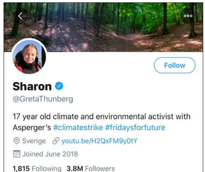
Pictured: Greta Thunberg changes her Twitter handle to Sharon