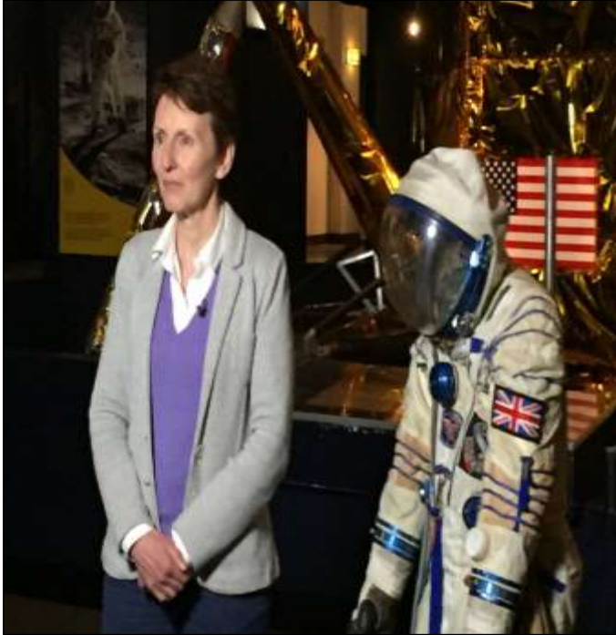
Pictured: Helen Sharman with her spacesuit at the science museum where it is displayed, taken from their Twitter page.

Helen Sharman, the first British astronaut to go to space, has said that aliens exist, and it is possible they are already here on Earth. Dr Sharman made history when she participated in a mission to the Russian modular space station Mir in May 1991. The first British cosmonaut said "Aliens exist, there's no two ways about it. There are so many billions of stars out there in the universe that there must be all sorts of different forms of life. Will they be like you and me, made up of carbon and nitrogen? Maybe not. It's possible they're here right now and we simply can't see them". She also spoke of the breath-taking beauty of the Earth from up high, "I'll never forget the first time I saw it. After take-off we left the atmosphere and suddenly light streamed in through the window. We were over the Pacific Ocean. The gloriously deep blue seas took my breath away."