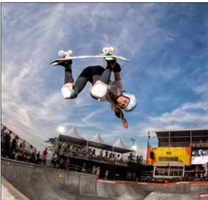
Pictured: Sky Brown competing at a skateboarding competition taken from her and her brothers Twitter page, Sky & Ocean.

Sky Brown is an eleven-year-old skateboarder who hopes to become Britain's youngest ever summer Olympian. She spends her time living between Japan and California in the United States and started skating not long after she could walk. Sky also has a love for surfing and won Dancing With The Stars: Juniors last year. She now boasts half a million followers on Instagram and is one of the youngest athletes to have ever been sponsored by Nike. She hopes she can inspire other young people, saying, "Everyone gets to see how cool skateboarding is; How fun it is; How creative you can be with it! I am super excited. I want to show girls it doesn't matter how old you are, you can do anything. So, if they see me, this little girl that does a trick, they will think they can do it too hopefully."